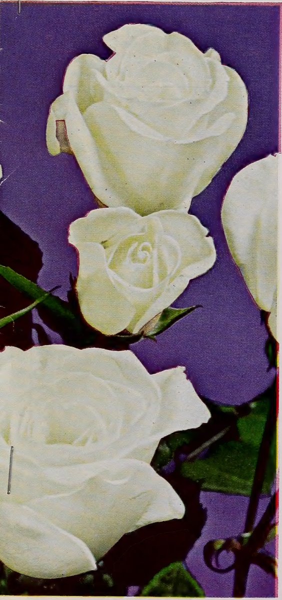
Perfect Contours In White By Jackson & Perkins

ALL AMERICA FLORIBUNDA SARATOGA P.A.F. $2.50